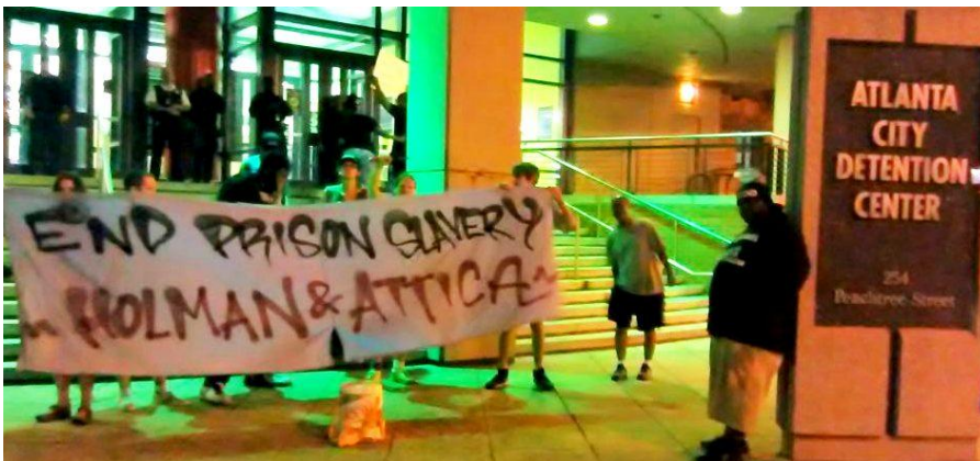
The 9 September was chosen because on 9 September 1971, prisoners took over and shut down Attica, New York State's most notorious prison.